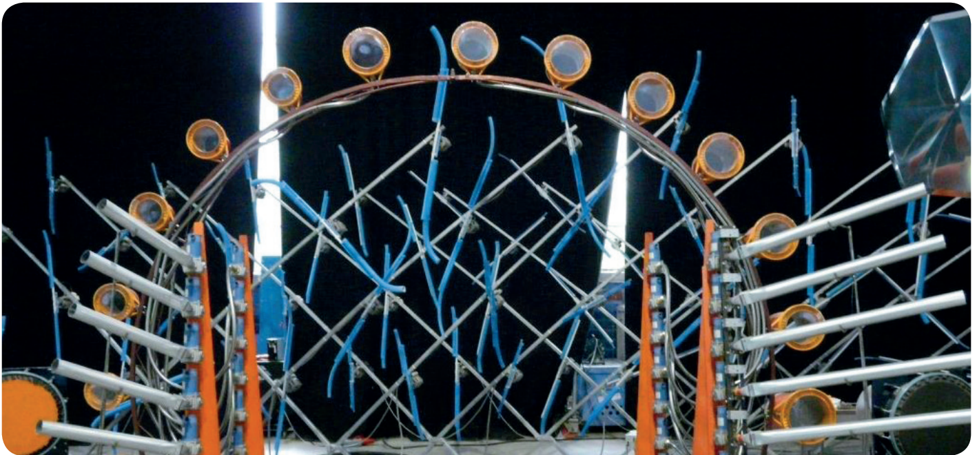
Both acoustically and visually impressive: Christof Schläger's instruments. Up to 128 compressed air horns are used to fill large open spaces with sound.

The instruments that are driven by compressed air range from a 20 cm long horn to a 4 meter high trumpet with multiple coils – all perfectly coordinated, just like a more traditional orchestra. And it's an impressive sight to behold too – they are real sound sculptures.